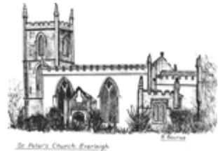
St. Peter's Church, Everleigh

The snowdrops and early daffodils are pushing their way up already – always such a welcome sight so early in the New Year. I always feel in need of something pretty to look at especially once all the Christmas decorations have been taken down and packed away.